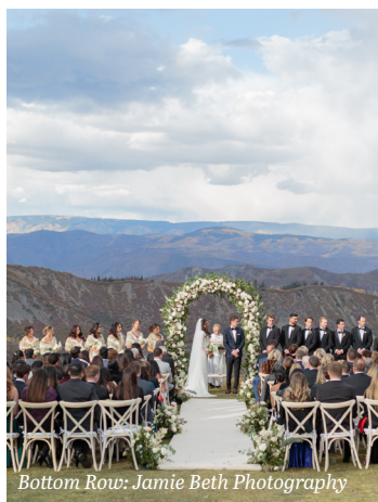
Bottom Row: Jamie Beth Photography