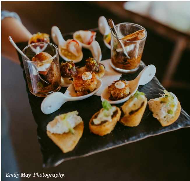
Emily May Photography